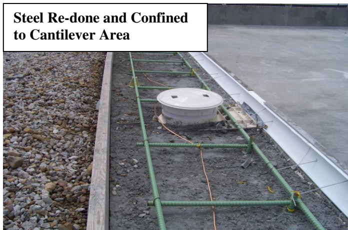
Steel Re-done and Confined to Cantilever Area