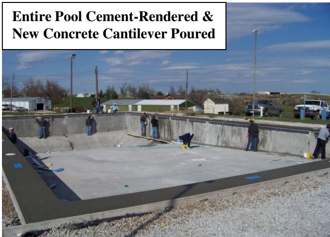
Entire Pool Cement-Rendered & New Concrete Cantilever Poured