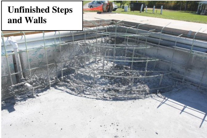
Unfinished Steps and Walls