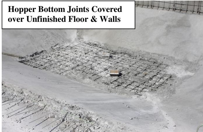
Hopper Bottom Joints Covered over Unfinished Floor & Walls